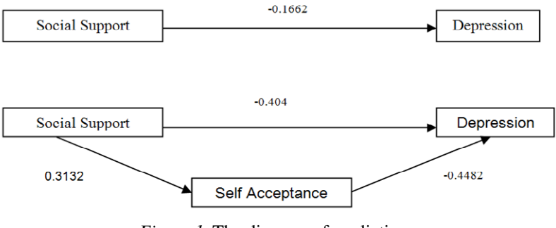
Figure 1. The diagram of mediation

The fourth analysis is the result of the direct effect of perceived social support on the depression, by controlling for self acceptance b(YX.M) = -0.0258; p=0.6758. This indicates that there is no correlation between perceived social supports on depression after controlling self acceptance. It can be concluded that by controlling self acceptance, the perceived social support significantly related towards depression. Result of the Sobel test also showed indirect effect of perceived social support on depression through self acceptance, which is -0.1404; p=0.0015. This indicates that perceived social support has a significant role on depression through self acceptance. In other words, self acceptance is the mediator of perceived social support and depression. Perceived social support increases self acceptance before decreasing depression.