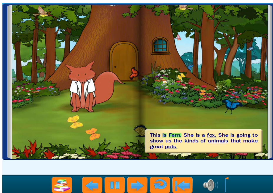
Figure 1. A screen shot of the website of story time for me

Because this study was designed for elementary school ELL students, SAVE theory was more highly valued in that almost all of the young learners tend to read short and easy materials for continuing reading, otherwise they are likely to lose interest and desire to read books. And as an application, a website for reading e-books ( http://storytimeforme.com ) was selected, and a book list was originally made on the basis of average vocabulary which was composed of 400-700 letters. Selected books were mainly fairy tales and fables which were helpful to students of basic English proficiency.