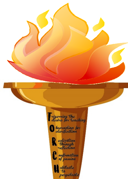
Figure 1. The TORCH Instructional Model

Based on the responses from research questions 1 and 2, an instructional model for implementing ITL's Practice Teaching 1 course, has been constructed to include all field study courses. The instructional model was developed from the emerging themes from the described experiences of the practice teachers. Figure 1 below shows the instructional model which carries the acronym TORCH.