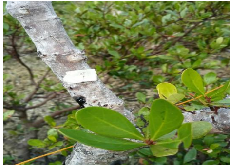
Figure 4. Saging-saging ( Aegiceras floridum )

endemic, which would mean it is found only in the Philippines. (POWO, 2024). The conservation status of Aegiceras floridum is Near Threatened (NT) on the International Union for Conservation of Nature (IUCN) Red List. Saging-saging ( Aegiceras floridum ) is a mangrove species that plays a contributing role in the carbon dynamics of coastal ecosystems, though its individual carbon storage is typically lower than larger-stature mangroves (Bobon-Carnice et al., 2023; Hilmi et al., 2023). The carbon sequestration potential of these stands is highly dependent on structural properties, showing a positive correlation with tree height and diameter at breast height (DBH) (Purnamasari et al., 2020).