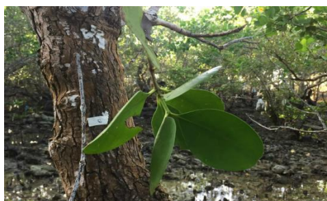
Figure 2. Pagatpat ( Sonneratia alba )

Sonneratia alba is classified as Least Concern (LC) on the IUCN Red List of Threatened Species due to its wide distribution and commonality throughout its range (Duke et al., 2025).