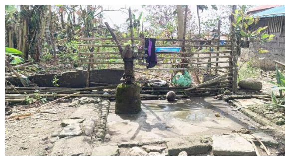
Figure 3. Sampling Station 2, Artesian Well