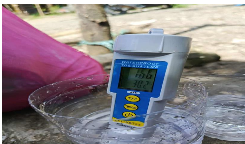
Figure 7. Measuring of pH, Using pH Meter