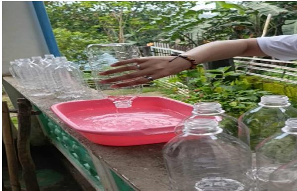
Figure 5. Container Sterilization

(Figure 5). Prior to sampling, water pipes were disinfected using sodium hypochlorite and flame-sterilized with 70% isopropyl alcohol (flFigure 6). Water was then collected after allowing it to flow briefly, ensuring proper handling and avoiding air bubbles to maintain sample integrity and reliable results.