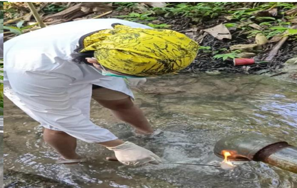
Figure 6. Flaming The Nozzle of Water Source for 30 Seconds

To assess the physicochemical parameters on-site at the three (3) sampling stations, the researchers utilized specialized instruments to ensure accurate and reliable measurements, following established guidelines and detailed step-by-step procedures to ensure the accuracy and consistency of results. The sample collection process conducted using proper techniques and protective equipment, strictly adhering to the protocols outlined in the Environmental Management Bureau – Department of Environment and Natural Resources (EMB–DENR) Water Quality Monitoring Manual.