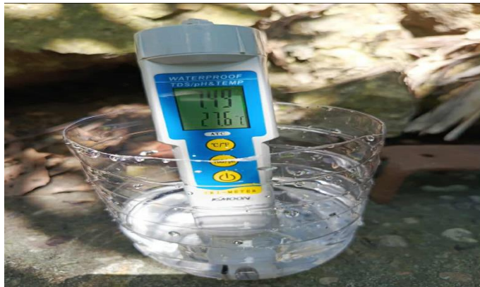
Figure 9. Measuring of Temperature, Using pH Meter in Temperature Reading

The biological quality of water, particularly fecal coliform, was analyzed at the Metropolitan Naga Water District (MNWD) laboratory. Physicochemical parameters such as calcium, chloride, color, and magnesium were examined at the Environmental Health Laboratory Services Cooperative in Naga City, Camarines Sur, while total suspended solids (TSS) were tested at Bicolandia Environmental Testing & Consultancy Services in Legazpi City, Albay. Nitrate and phosphate analyses were conducted at the Regional Soil Laboratory (RSL) in Pili, Camarines Sur.