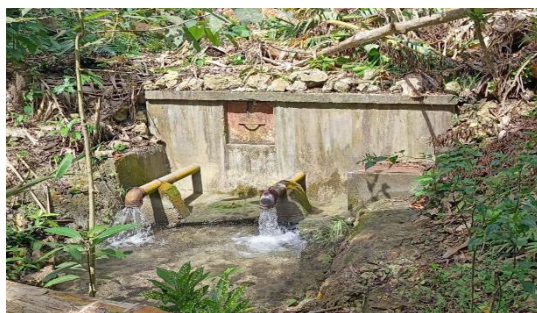
Figure 2. Sampling Station 1, Small Water Impoundment System

Sample Stations - Three (3) sampling stations were established within Sitio Sarimao to collect water samples from the primary sources utilized by the local community. These stations were strategically selected to represent variations in elevation, surrounding land use, and potential exposure to environmental and anthropogenic influences. Station 1 is located at a higher elevation and consists of a Small Water Impounding System (SWIS) surrounded by trees and diverse vegetation (Figure 2). The presence of dense flora provides natural protection to the water source, potentially reducing direct contamination while also influencing physicochemical characteristics through organic matter input.