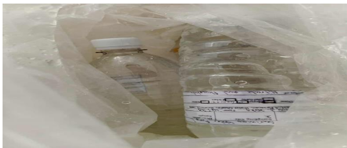
Figure 10. Sample Preservation

After collection, water samples were properly stored, placed in ice boxes, and promptly transported to the respective laboratories to preserve sample integrity and minimize changes in microbial content (Figure 10). The results were then evaluated and compared with the standards set by DENR Administrative Order (DAO) 2016-08 and the Philippine National Standards for Drinking Water (PNSDW) to determine the suitability of the water for human consumption.