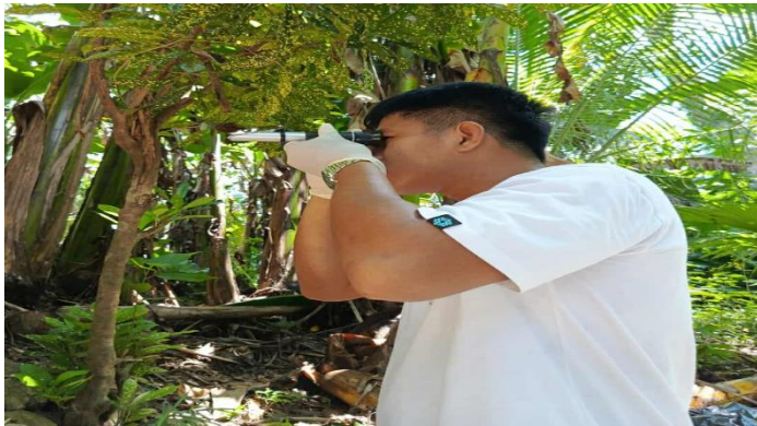
Figure 8. Salinity Measurement, Using Salinometer