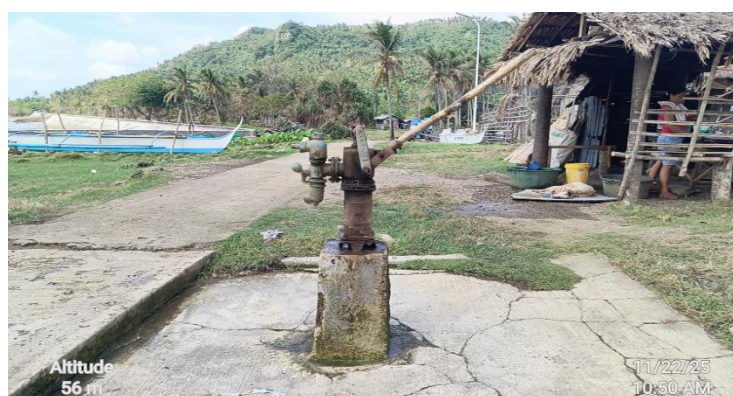
Figure 4. Sampling Station 3, Artesian Well