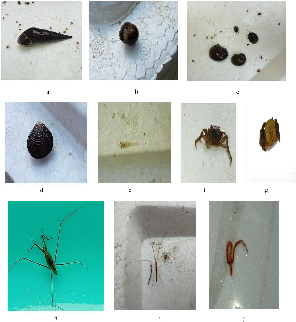
Figure 1. Image of the ten (10) macroinvertebrates found within the three stations in Mainit, Balogo River, (a) Jagora asperata , (b) Lymnaea stagnalis , (c) Pomacea canaliculate , (d) Ruditapes philippinarium , (e) Acetes spp, (f) Scylla spp, (g) Varuna litterata , (h) Gerris lacustris , (i) Veliidae (j) Hediste Diversicolor .

Level of Diversity of Macroinvertebrates in Balogo River - The macroinvertebrate community in the Mainit–Balogo River is composed of several species with varying levels of abundance, density, frequency, and dominance. Overall, the data indicate that a few species contribute a large proportion of the total population, while others are present in relatively low numbers. This suggests an uneven distribution within the community, where certain organisms are more adapted to the existing environmental conditions. The computed values for relative abundance, population density, and dominance reveal that the community structure is influenced by species that occur more frequently and in higher quantities. Meanwhile, the presence of less abundant species still contributes to the overall biodiversity of the river. In general, the table reflects a moderately diverse macroinvertebrate community, with